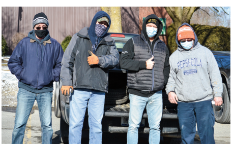
Fitzgerald Brothers recently ratified a new contract that saw substantial wage increases.