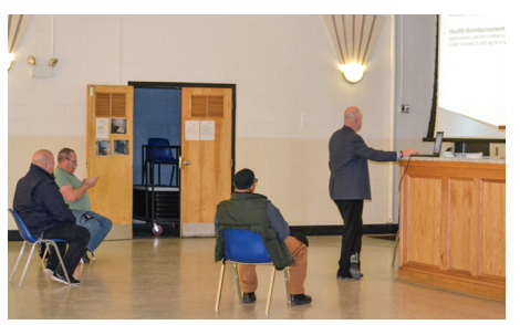
Quality Carriers/Quala Wash participate in a contract update.